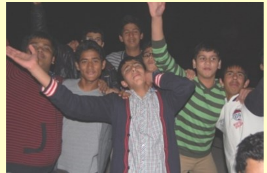
EMERALD HOUSE ACADEMIC CHAMPIONS (2011-12) 22 February